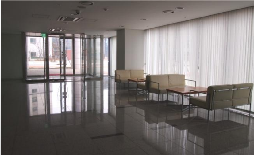
Lobby & Room(Single)